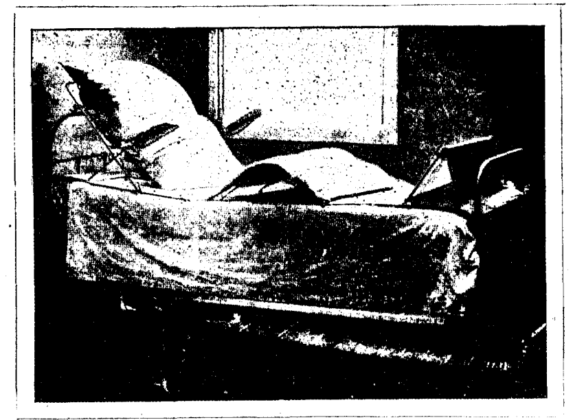
AN IMPROVED BED REST.